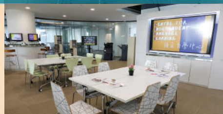
CENTRE FOR INDEPENDENT LANGUAGE LEARNING 語文自學中心