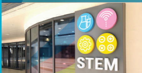
STEM EDUCATION CENTRE STEM 教育中心