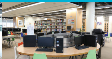
LEARNING RESOURCES CENTRE 學習資源中心