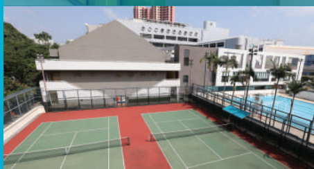
WELLNESS CENTRE 健樂中心