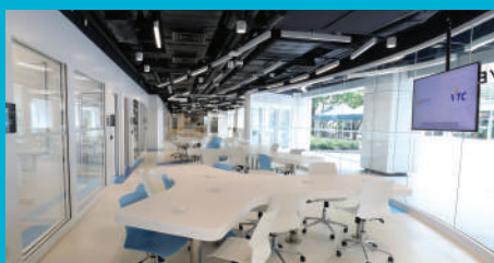
LEARNING COMMONS 學習共享空間